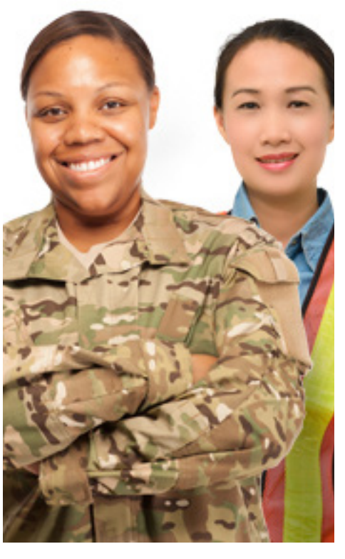
[ Article was originally posted on www.sba.gov 1

The U.S. Small Business Administration today announced that nonprofit organizations, state and local agencies, and institutions of higher learning are eligible to compete for funding of up to $300,000 to deliver entrepreneurship training to women service members, women veterans and women military spouses.